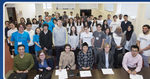
Participants and judges from the ASA DataFest at the University of Toronto April 30 – May 1, 2016

Applications to CANSSI and ASA must be made by February 28, 2018 . The competition itself should be held from March through May.